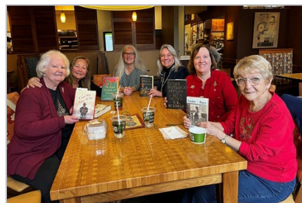
Book Club Holiday Party

Each of them carries a lifetime of grievances, hurts, secrets, and passions that are ready to boil over. None of them is entirely who they appear to be. And all of them—the bank robber included—desperately crave some sort of rescue. As the authorities and the media surround the premises these reluctant allies will reveal surprising truths about themselves and set in motion a chain of events so unexpected that even they can hardly explain what happens next.