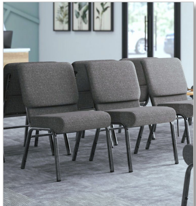
And these chairs are 'Just Right'

"Our chairs are never truly empty; our memories will always fill them." - PG