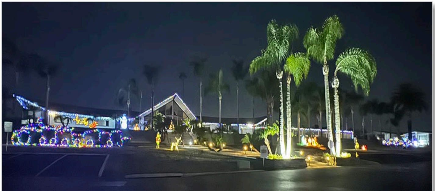
Our Clubhouse and Landscape Adorned with Christmas Decorations – Beautiful Indeed! Our thanks to the Maintenance Team!