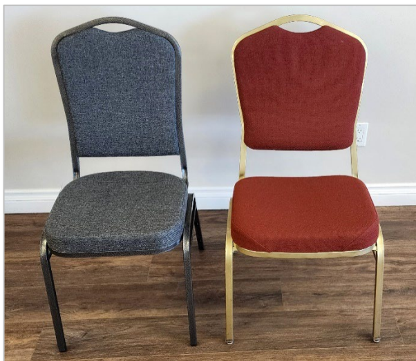
Our New Chairs (left) versus Old Chairs (right)

This inspired a couple of us Board members to go on a field trip. We went to Palomar West, and then to the San Marcos Senior Center to check out the chairs. We found that West had larger church-style chairs (or waiting room chairs). Much to our surprise, the Senior Center had the smaller, similar banquet-sized chairs that we just received. These were placed at their